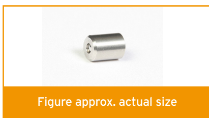
Figure approx. actual size