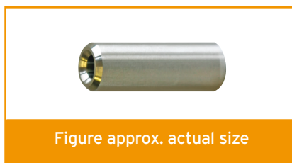
Figure approx. actual size